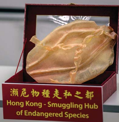
Totoaba maw display at press conference held by Greenpeace East Asia.

Some traders are still openly displaying totoaba maws; however many traders are reluctant to sell their stock. This may be due to the drastic fall in prices for totoaba maws rather than any enforcement measures carried out. Many traders are holding on to stock, banking on a future hike in price which will allow them to recoup their investment.